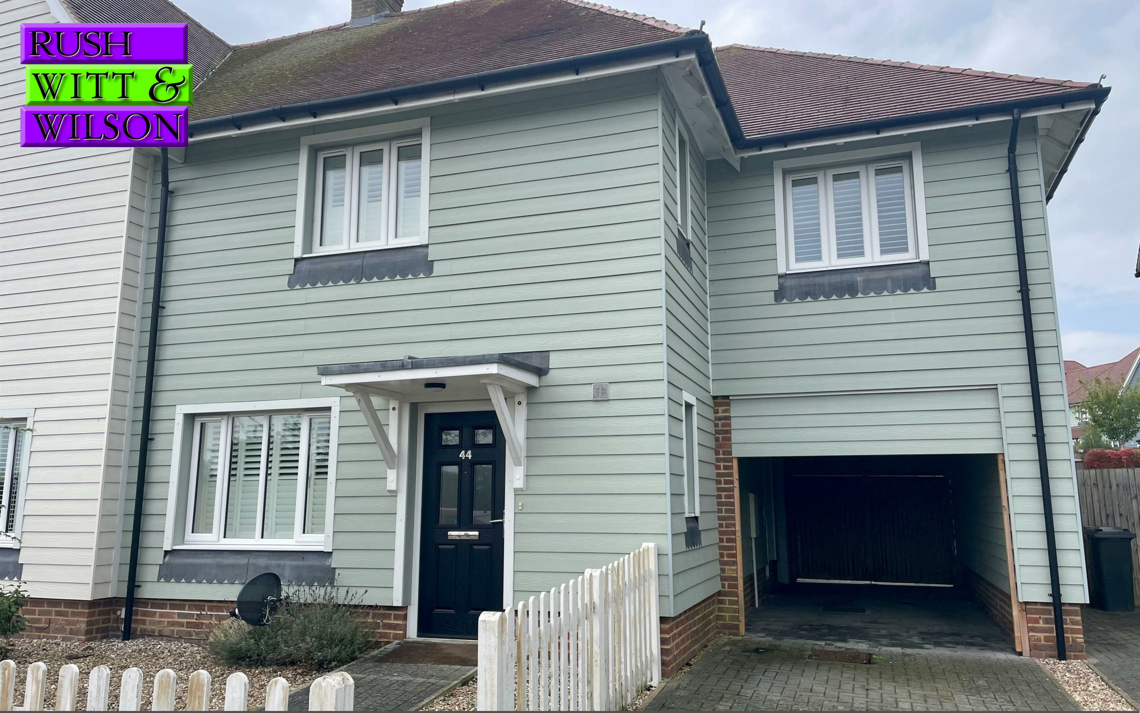
44 Vidler Square, Rye, East Sussex TN31 7FP Guide Price £430,000